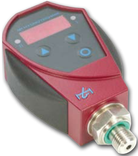
PS120 (formerly known as Multi-EPC)

Available in standard and DESINA version with stylish rotatable casing and 4 digit easy to read pressure display. Optional with one or two independently programmable switching values and an analogue output of pressure values.